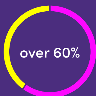
incomes in the $75k-$120k range