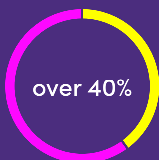
listeners with college degree