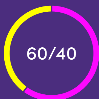
female to male listeners

Our audience gender profile is roughly 60/40 female to male. Over 40% of our listeners have a college degree and more than 60% have incomes in the $75,000-120,000 range. Sixty percent of our listeners own their own home. Many long-time listeners are opinion leaders who share what they learn with friends and family. Many culture makers and artists listen regularly.